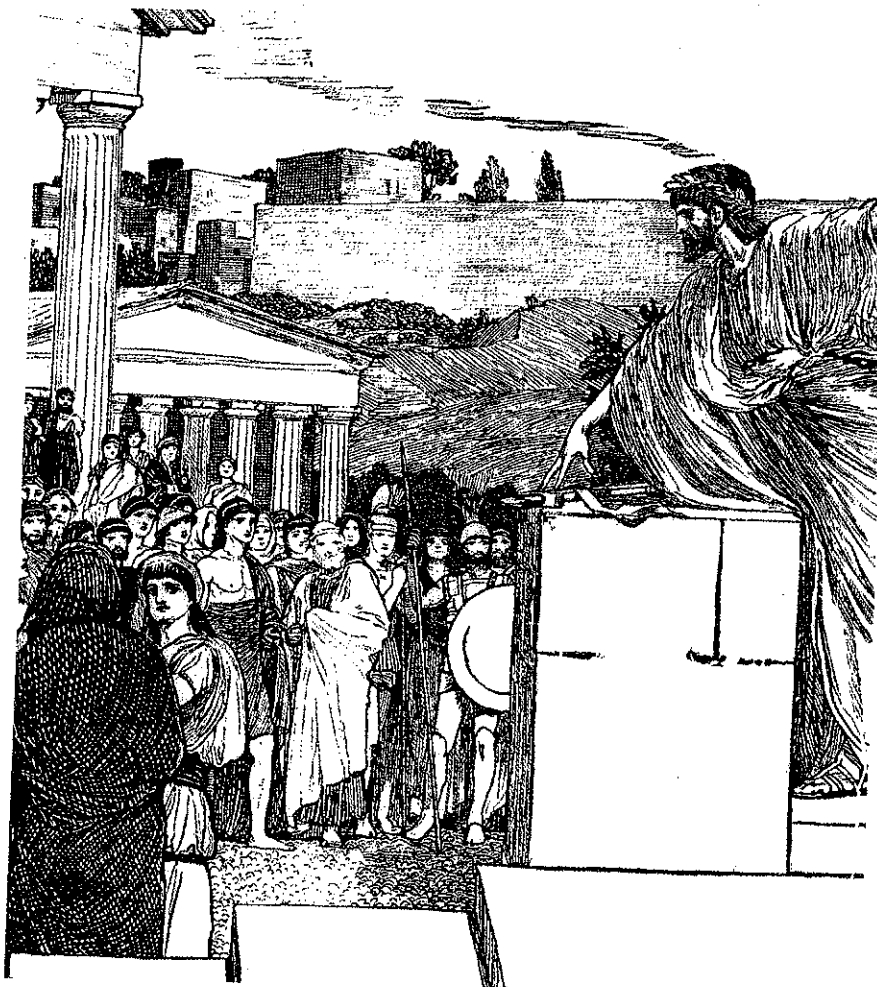
Desmosthenes, an Athenian leader, speaks to the Assembly.

Most Athenian men enjoyed taking part in the city's democracy. They liked to gather and debate the issues. They were proud of their freedom as Athenian citizens.